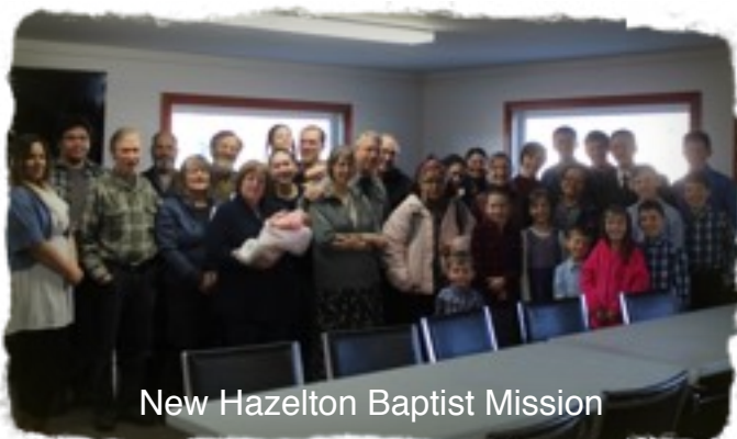
New Hazelton Baptist Mission

It has been a real encouragement to us to see the Lord work in the mission work in New Hazelton. It is obvious that He is speaking to people and working in their hearts. We have had a number of new visitors attending over the past few weeks. There was a record attendance at the last service of 41 people. Praise the Lord! Many of these people have never been saved and none of them have ever really been disciplined in sound doctrine. There is